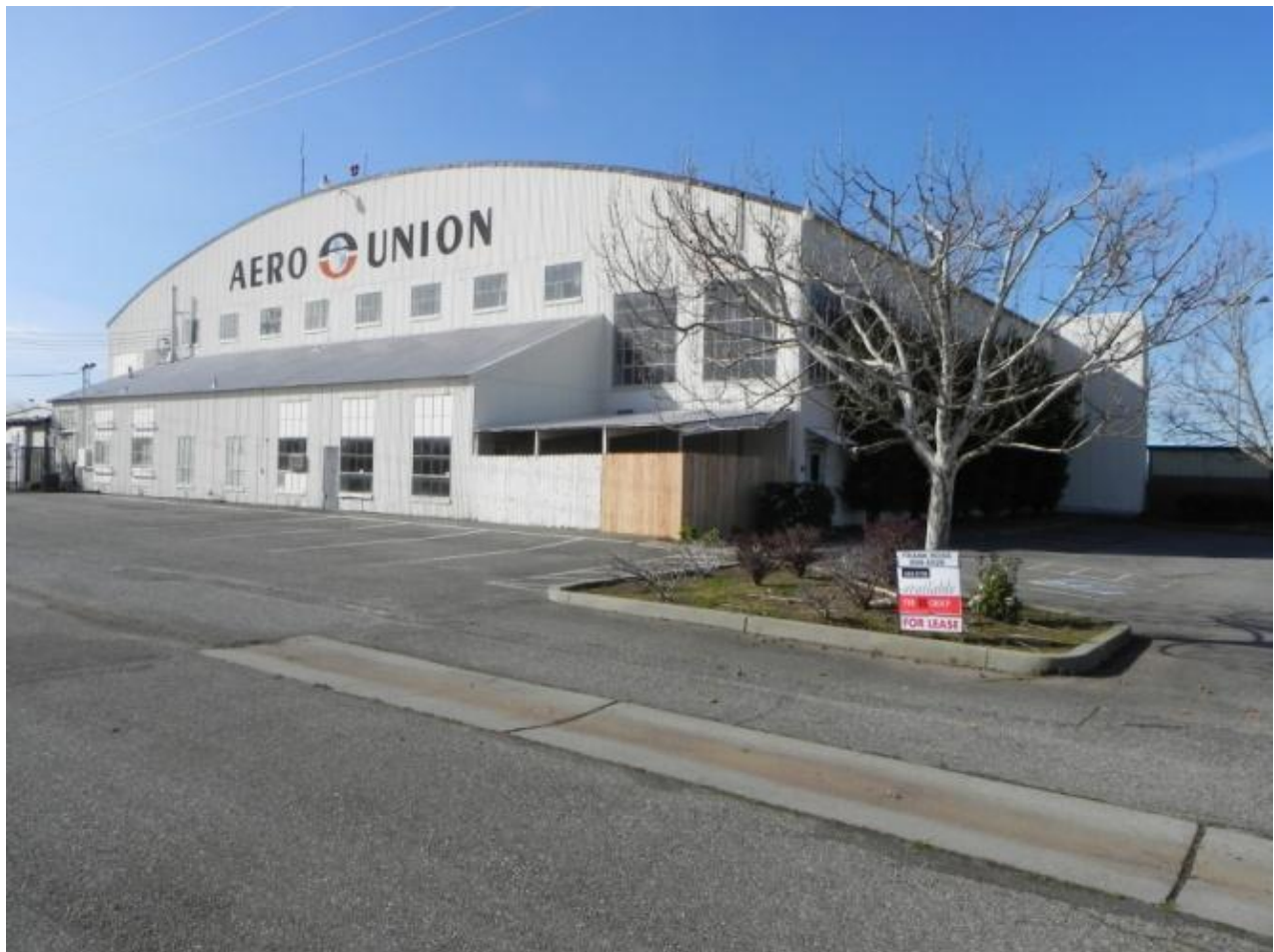
165 Ryan (known as Hangar 1499 during WWII)

With the sudden departure of Aero Union Corp as a tenant of six major flight line hangar facilities, the once unattainable vintage hangar facility located at 165 Ryan Avenue is now up for lease. The hangar was built in 1942 as the newly designated Chico Army Air Field began performing engine changes on the venerable BT-13 aircraft and eventually on P-38's P-63 and P-39's operated by the 433 rd Combat Crew