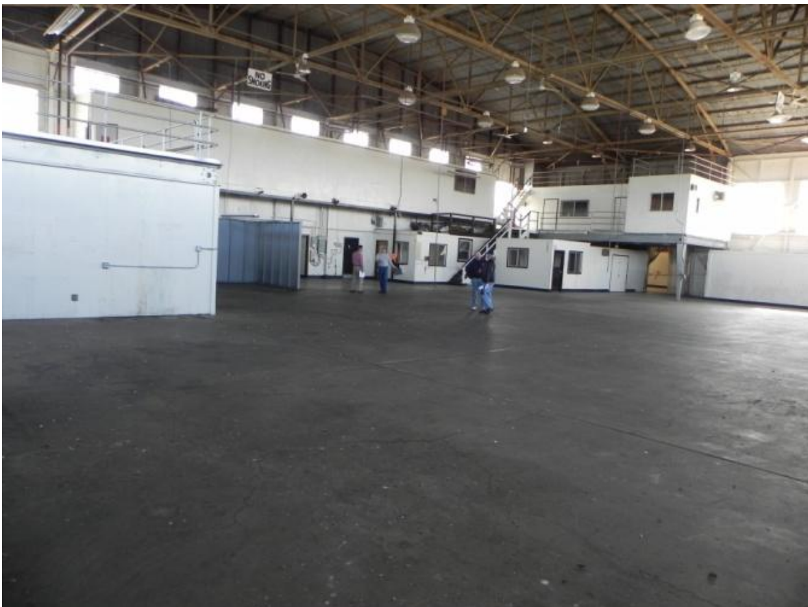
Interior of 165 Ryan showing in-buildings and steel trussed ceiling

However, it was noted by the City that other parties have expressed interest in leasing the facility as well. Certainly, time is of the essence if CAM is to utilize this perfect opportunity to develop a First Class Air Museum.